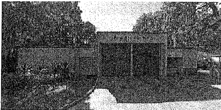
Elizabeth Ave Orlando, FL 32804

Map data ©2017 Google United States 100 ft