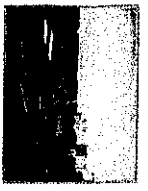
NORTHWEST GRASSY AREA