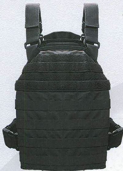
PLATE CARRIER FEATURES:

When a threat situation escalates, simply don the Plate Carrier over your existing Point Blank soft body armor and immediately upgrade your protection. The carrier accepts 10"x12" Level III+ hard armor plates and offers multiple design features.