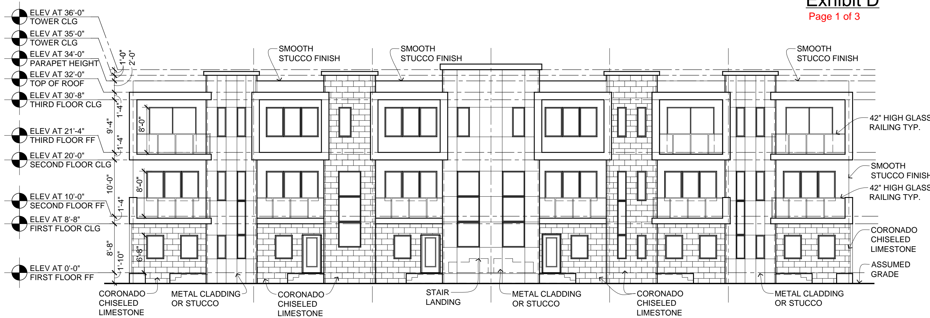
1 FRONT ELEVATION 3/32" = 1'-0"