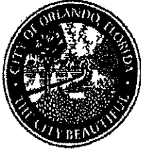
EXHIBIT tabbies A